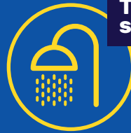
The naked showers!