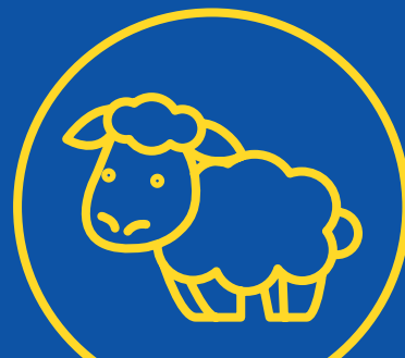
The sheeps on the road, so cute :-)